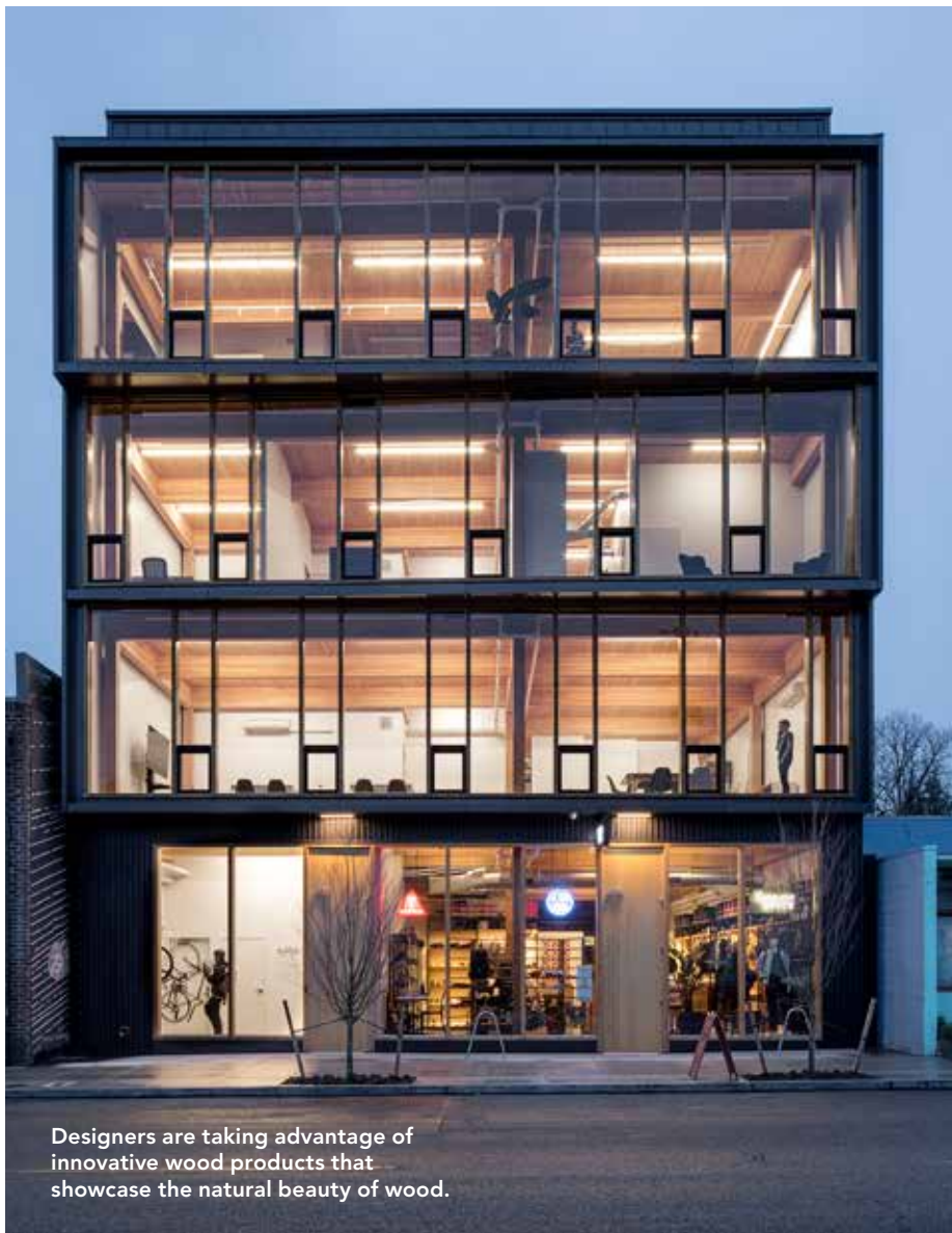
Designers are taking advantage of innovative wood products that showcase the natural beauty of wood.

Using wood in nonresidential buildings is not a completely new idea, but rather a revival. Innovative new construction techniques are expanding the use of lumber; these techniques utilize engineered wood products such as cross-laminated timber (CLT), nail-laminated timber (NLT), dowel-laminated timber (DLT), and structural glued-laminated timber (glulam). These “mass timber” products have great structural capability