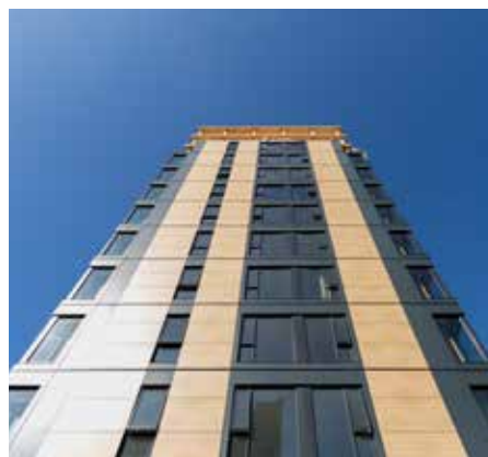
Featuring a hybrid mass-timber system, Brock Commons demonstrates the application of mass timber in high-rise construction.