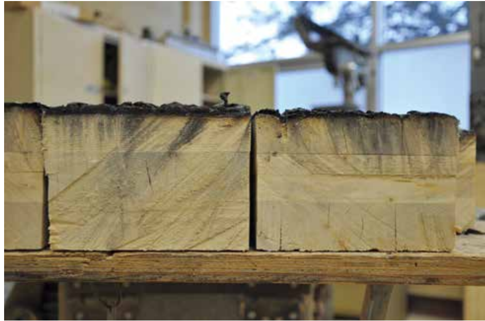
Fire tests show that CLT chars slowly at predictable rates.

Under the 2018 IBC, designers can use fire walls to create separate building portions that do not exceed the height and area limits set by code. This option can be exercised when sprinklers either aren't an option or don't afford the necessary increases for the project's use and site characteristics. In Type V Construction, fire walls are permitted to be of wood-frame construction, allowing designers to divide the structure into separate buildings