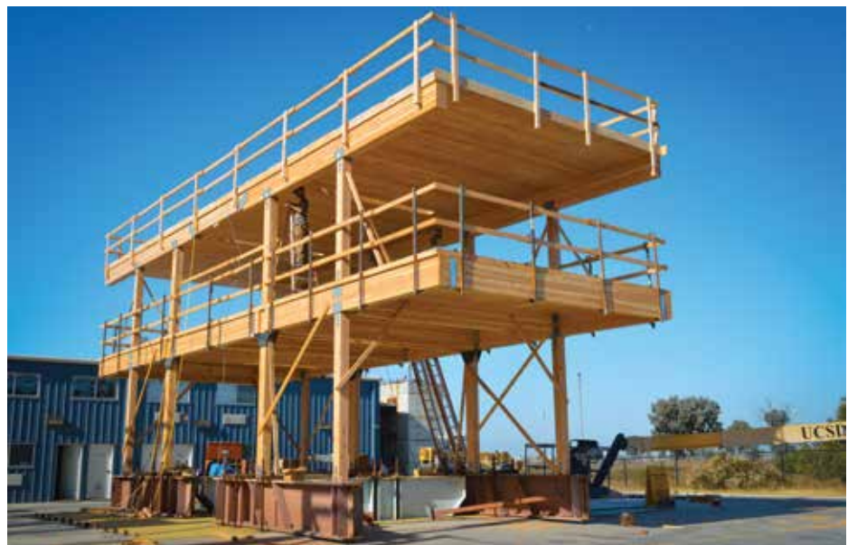
Shake table testing exposes full-scale buildings to simulated seismic events.