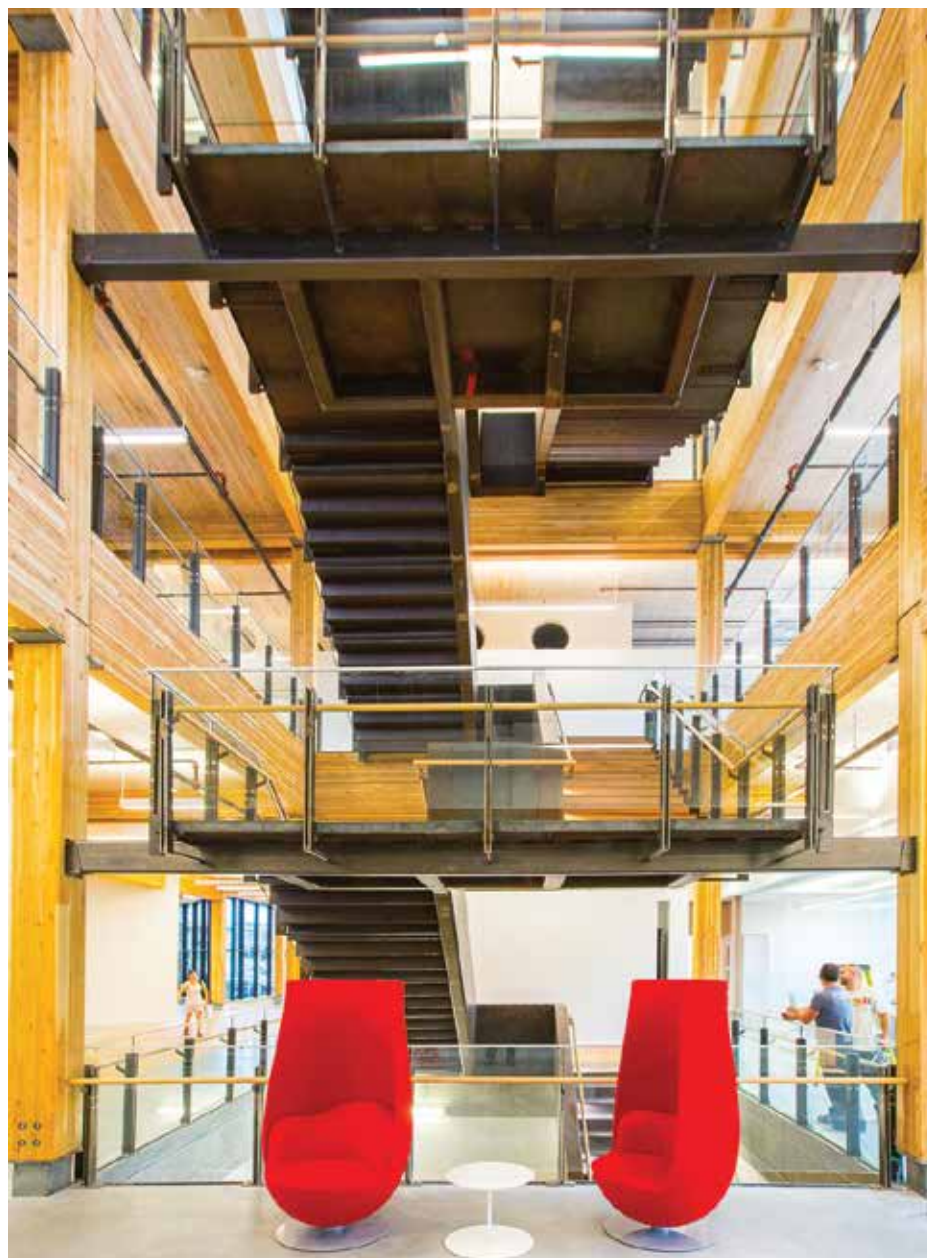
The MEC headquarters building in Vancouver, British Columbia, features an open plan and lots of exposed wood, which contributes to the health and well-being of employees.

For institutes of higher education, new buildings also provide opportunities to showcase innovative technologies, some of which have been developed at the institu-