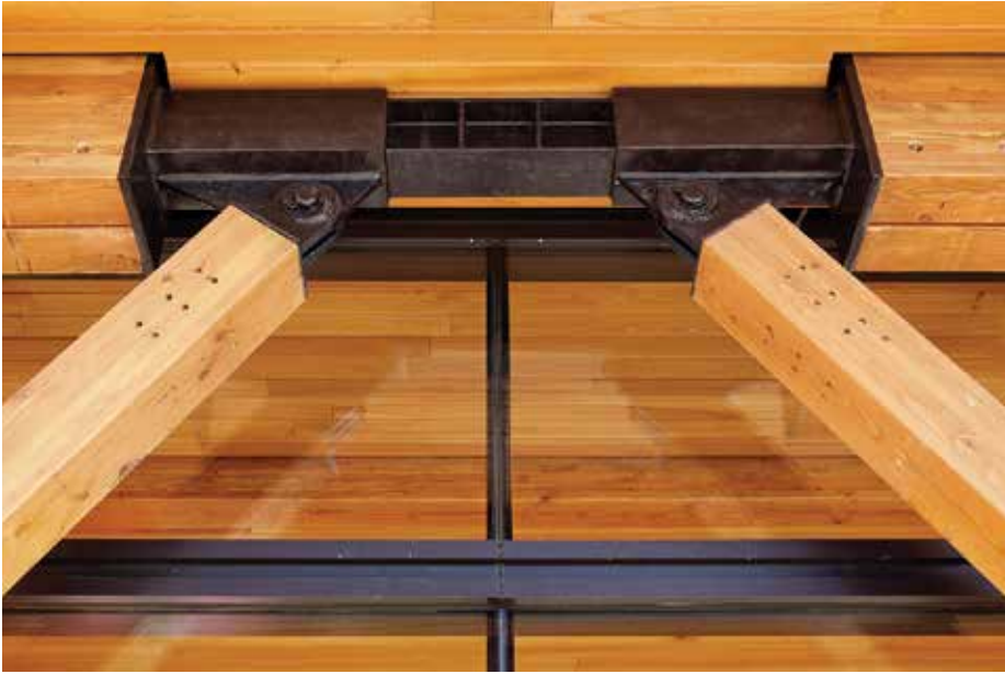
At the Jackson Hole Airport in Jackson, Wyo., embedded steel knife plates with structural screws provide load transfer at brace-to-beam connections.

Photo: Gensler, 2015 WoodWorks Wood Design Award, Matthew Millman Photography