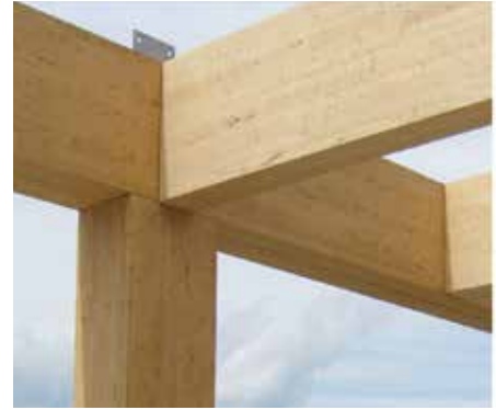
Modern Computer Numerically Controlled (CNC) connections provide the ability to fabricate joints with precision. This is especially useful when fabricating joints on large members with complex shapes.

or tightening with a wrench or other torque device.