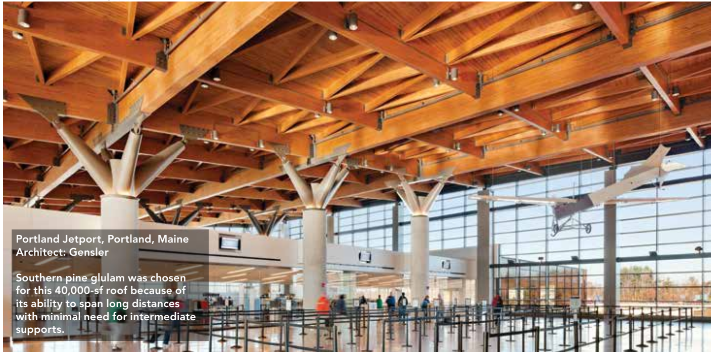
Portland Jetport, Portland, Maine Architect: Gensler

Southern pine glulam was chosen for this 40,000-sf roof because of its ability to span long distances with minimal need for intermediate supports.