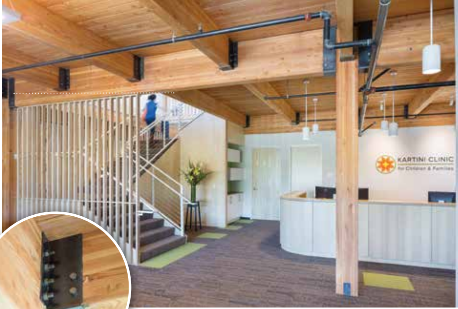
Designed by Path Architecture, Radiator is one of the first five-story timber-frame office buildings to be built in Portland, Ore., since the early 1900s. Fabricated steel bucket-style connectors with bolts were utilized for glulam beam-to-beam connections.