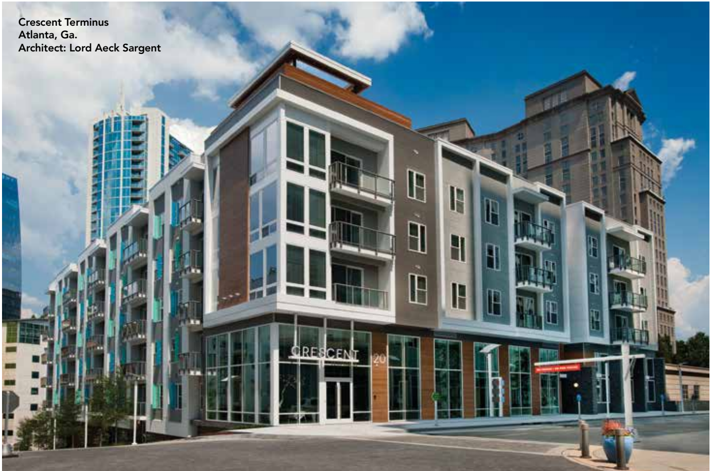
Crescent Terminus Atlanta, Ga. Architect: Lord Aeck Sargent

In designing connections, it is important to design and detail the connection such that the member's shrinkage is not restrained. Otherwise, shrinkage of the wood member can cause excessive tension perpendicular-to-grain stresses and splitting may occur. Specific issues related to shrinkage include: